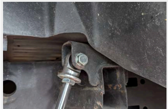
Figure 3A: Upper Shock Bolt Loose