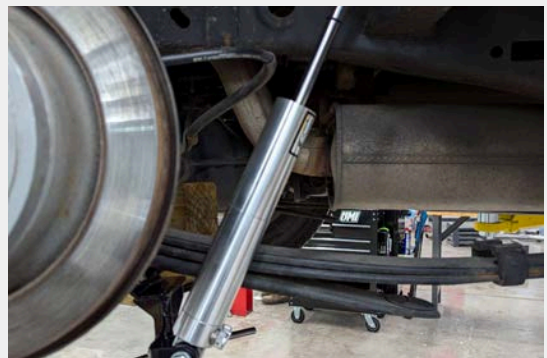
Figure 8: Installed Shock