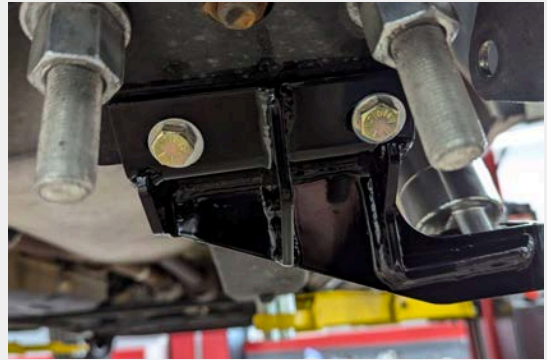
Figure 5: loosely installed bracket.