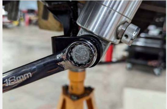
Figure 6: Tighten Shock