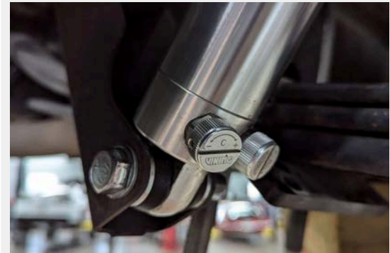
Figure 2: Loosen shock Bolt.