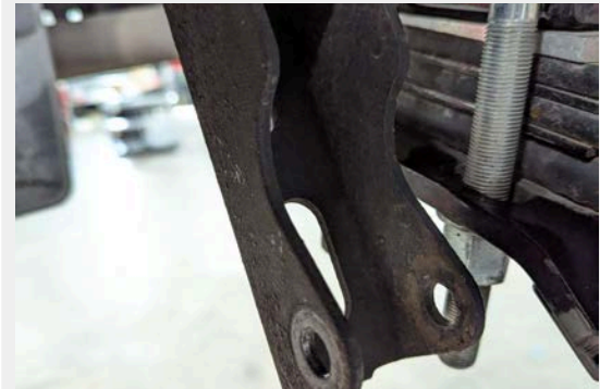
Figure 3: Shock Bolt removed