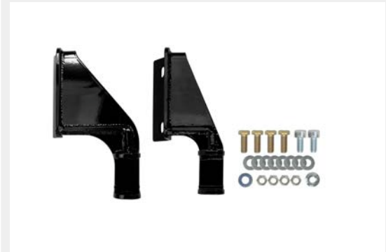
Figure 1: Kit Contents