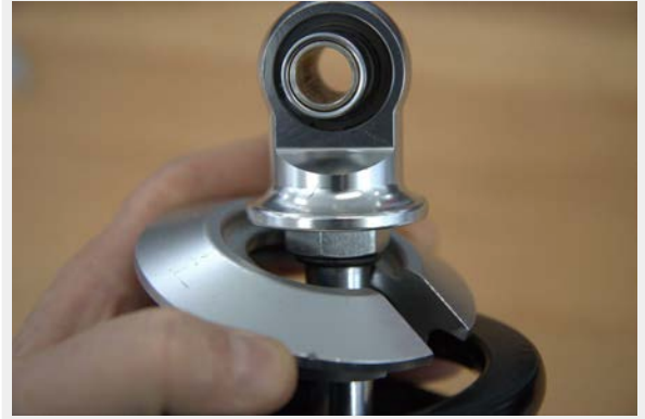
Figure 11: Spring Cap