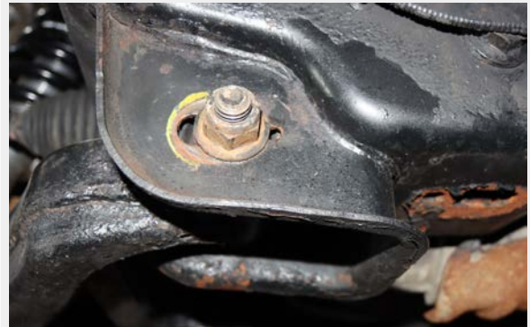
Figure 17: Camber Adjustment