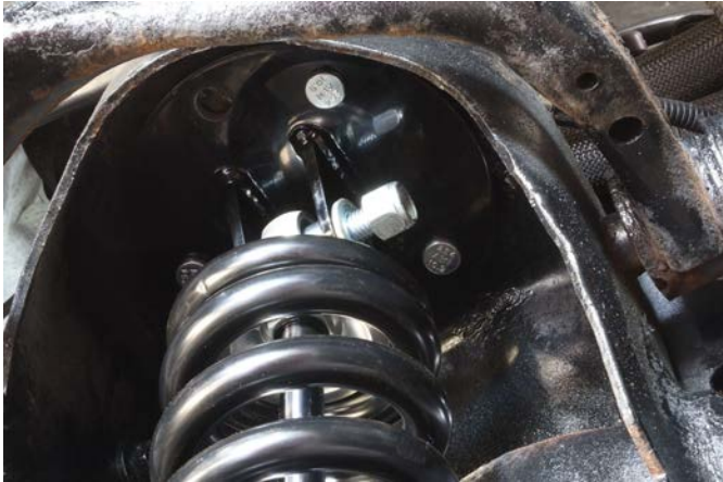
Figure 14: Upper mount Install

PROTIP: Now is a good time to set a starting point on compression and rebound for the front shocks. We have found that 10 clicks on compression and 14 clicks on rebound is a good starting point. Further adjustment may be needed based on desired shock characteristics.