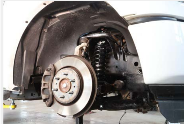
Figure 13b: Front Reassembled