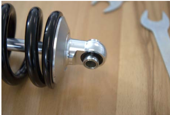
Figure 9: Assembled bearing

A) Remove the coilover shocks from their packaging (Fig 8) and install the upper and lower bearing assemblies. Using snap ring pliers, install one snap ring in the designated groove on top and bottom of the coilover. Push bearings into shock eyelets and install remaining snap rings. (Fig 9.)