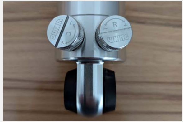
Figure 16: Viking Adjustment Knobs

Alternatively, the upper control arm can be swapped out for one of our control arms. These will be available in adjustable and non-adjustable versions. Please visit www.umiperformance.com for more information on the products.