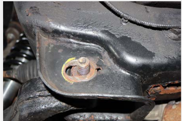
Figure 18: Camber Adjustment