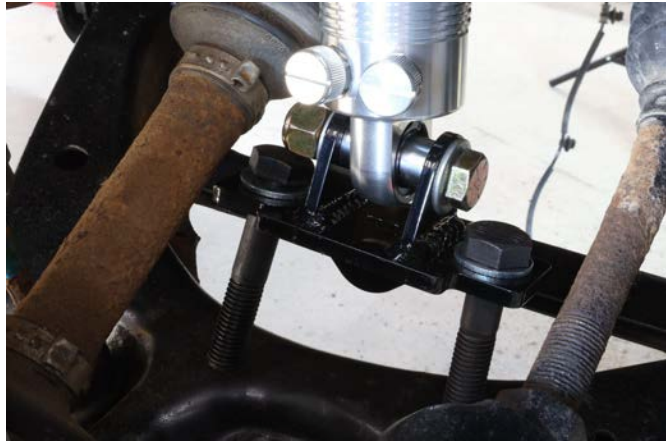
Figure 15: Lower Mount Install

H) Torque upper 12mmx1.5 coilover nuts to 70 ft/lbs. Torque Lower M14x2 nuts to 125 ft/lbs. \frac{1}{2} "-13 upper and lower coilover thru bolts get torqued to 90 ft/lbs.