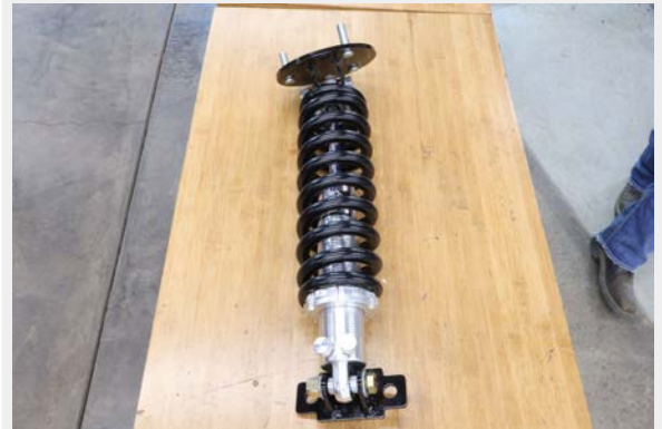
Figure 13: Full Coilover assembly