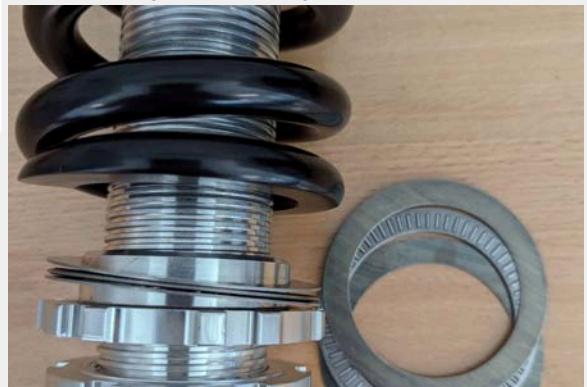
Figure 10: Perch Nuts, Thrust Bearing installed