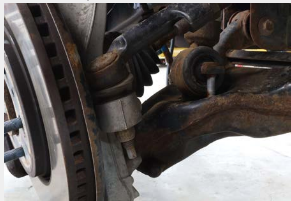
Figure 4: Tie rod end removal