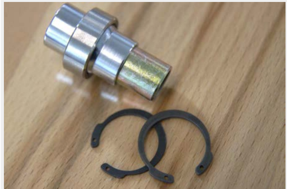
Figure 8: Bearing Installation