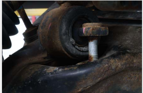
Figure 3: Shock Removal