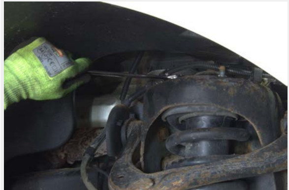
Figure 6: Remove nuts