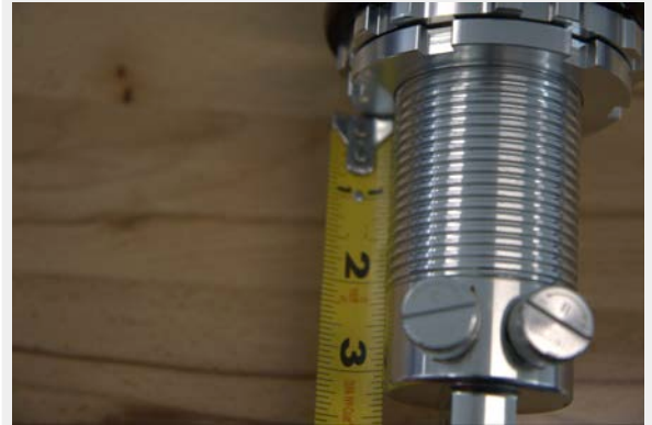
Figure 12: Set Ride Height