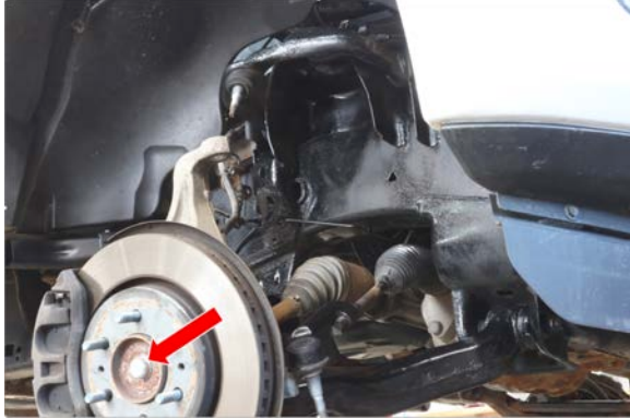
Fig 7: Strut Removal

G) On 4wd trucks, remove the CV axle nut cover and nut (13mm socket) (Fig 7). Remove the strut assembly from the truck. Be sure not to overextend or stretch the ABS cable and brake hose.