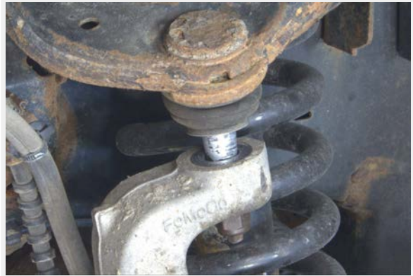
Figure 5: Ball joint removal

E) Using a tape measure, set the spring perch at 3-1/4" measured from the bottom of the shock. (Fig. 12). This will set the front ride height at approximately a 4" drop from factory ride height. Further adjustment may be needed.