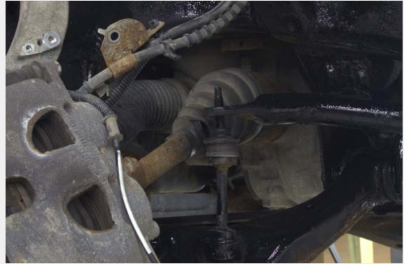
Figure 2: Sway Bar End Link Removal